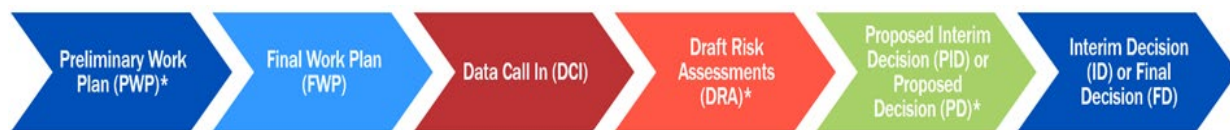
Figure 2: Registration review process

agency action. The docket for a pesticide registration review includes a preliminary work plan that summarizes the information the EPA has on the pesticide and the anticipated path forward. The EPA publishes a notice in the Federal Register announcing the availability of the docket and providing the public with a comment period of at least 60 days. The EPA then considers the information received during the comment period to develop a final work plan . If the EPA determines that it needs more information from the registrant, it issues a data call in notice. Next, the EPA publishes another Federal Register notice announcing its proposed decision or proposed interim decision, and it provides the public with another comment period of at least 60 days. After considering any comments on its proposed decision, the EPA issues an interim or final registration review decision, including an explanation of any changes made since the proposed decision and a response to any significant comments received during the public comment period. Figure 2 summarizes the registration review process.